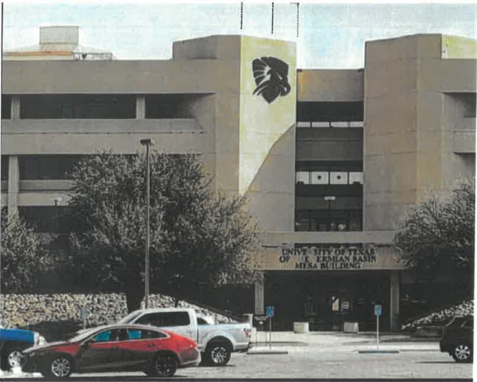
Exhibit B Building Elevation